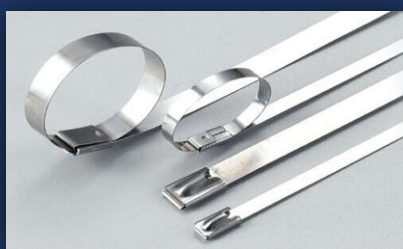
B. Stainless Steel Cable Tie