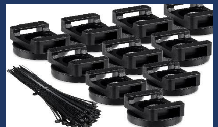
C. Magnetic Cable Tie