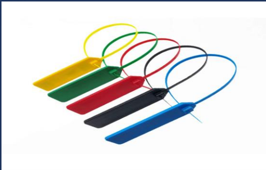
A. PVC Cable Tags

PVC & Stainless-Steel Cable Tags are available.