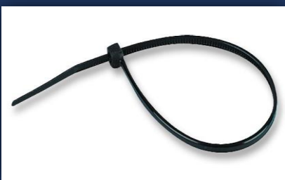
A. Nylon Cable Tie

A Cable tie is a type of fastener for holding items together, primarily electrical cables and wires.