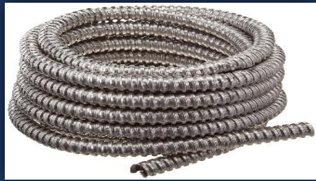
B. Metal Spring Conduit