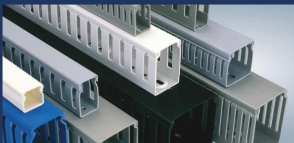
A. PVC Cable Tray