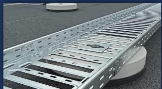
B. Metal Cable Tray