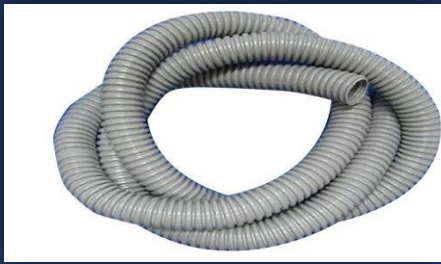
A. PVC Spring Conduit