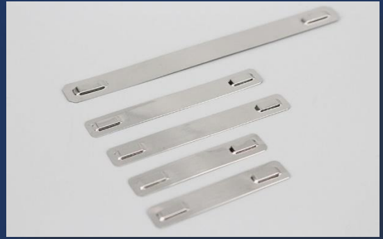
B. Steel Cable Tags